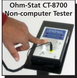
Adjustable limits. Test each foot and wrist individually and simultaneously

When used with a computer and leading edge software the employee's test results are stored in the computer and then can be emailed to supervisors. NO MORE LOG BOOKS. These reports and data can help conform your company to EDS 20/20 specifications or ISO standards. Speed up testing, and eliminate no tests.